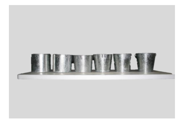
Figure 1. Types of buckets used.

The correlation graph showed a direct relation between the base diameter of the bucket and the strength required to spill the liquid content (Figure 3). The regression equation showed a direct relation between "diame-