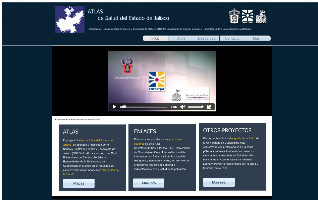
Figure 2. Homepage of the Health Atlas of Jalisco showing the main menu and the introductory video.

selected, the mapping tool on that category is displayed. The second is selecting a category from the submenu in the Atlas option on the main menu, which links directly to the mapping tool to choose data from the category selected.